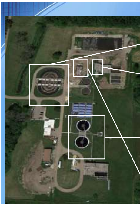
November 14, 2012 Clark County Utilities Department