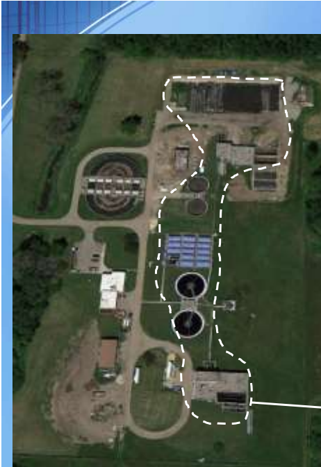
November 14, 2012 Clark County Utilities Department