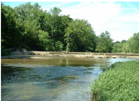
Several dams on the Olentangy River are being considered for removal. The upper photo shows the Dennison Dam. The photo to the right shows the free-flowing river after the dam was removed.

The TMDL report provides specific numeric goals for reducing pollutants, including pathogens, phosphorus, sediment, and habitat. Ohio EPA can address some of the Olentangy's problems through regulatory actions, such as permits for wastewater and stormwater dischargers. Other actions, such as committing to adequately-sized stream corridors and flood plains, will be up to local authorities and private property owners.