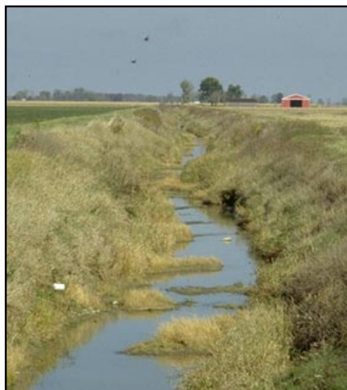
Above: The top photo illustrates a stream with high quality and exceptional aquatic life; stream habitats characterized by the bottom photo (monotonous habitat, slumping bank, no riparian) typically have poor aquatic life.

habitat affects in the agricultural northwest and in urban areas of Ohio..