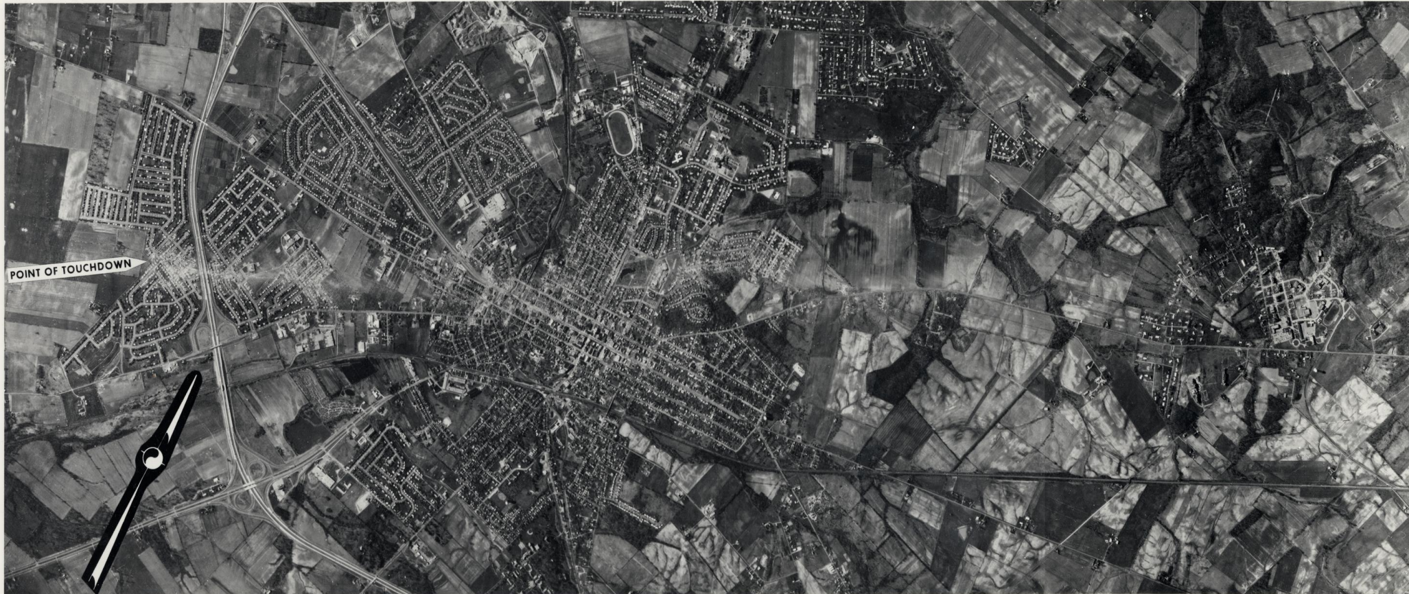
TORNADO PATH OF DESTRUCTION - XENIA, O. TO UNIVERSITY AREAS - USAF PHOTO 4 APRIL 1974