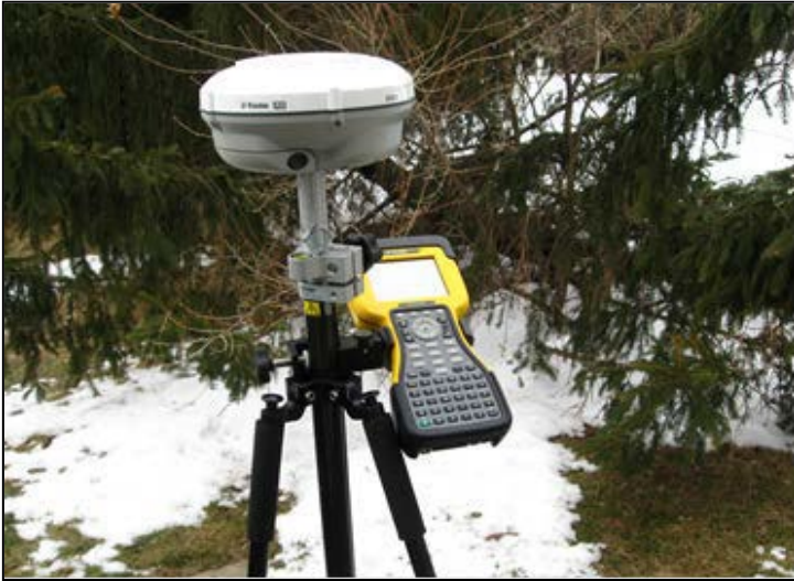
Trimble R8 GPS unit collecting elevation data.