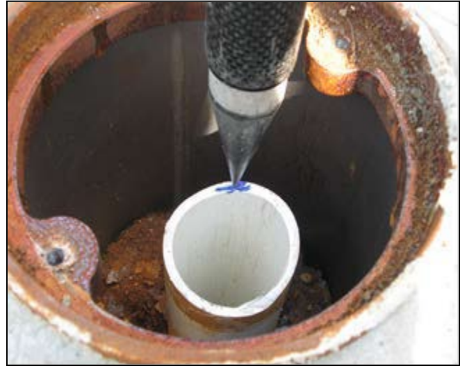
Collecting elevation data from the top of a well casing.