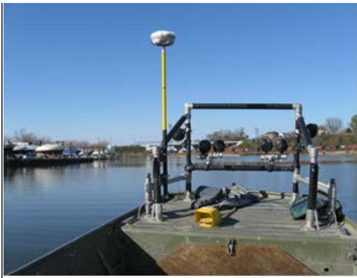
GPS unit performing topographic survey of a lake bottom in order to assist in calculating volume of contaminated sediment.