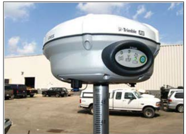
Subcentimeter GPS unit

SIFU uses a Trimble R8 survey grade Global Positioning System (GPS) device to achieve coordinates which have the potential for up to 1/100-foot precisions in a very short time period. This data can be used to create ground water flow maps and digital topographic maps of land surfaces. This GPS can also be used to monitor landfill subsidence and can be used in conjunction with a boat to topographically map the bottom of lakes and rivers.