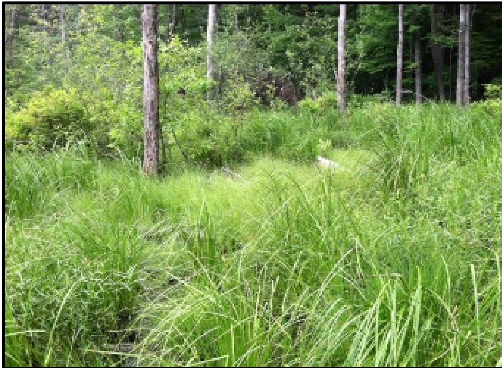
Kent Bog – Open sphagnum meadow with three-way sedge ( Dulichium arundenaceam ), woolgrass ( Scirpus cyperinus ), and prickly bog sedge ( Carex atlantica )