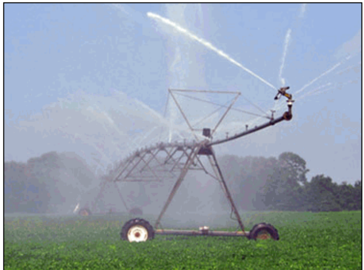
There are restrictions on applying treated wastewater within drinking water source protection areas.

When wastewater is applied to the land, growing plants and naturally occurring soil bacteria use the nutrients found in treated wastewater. Treated wastewater sprayed on the land surface may also infiltrate (seep) into the ground, replenishing the underlying aquifer.